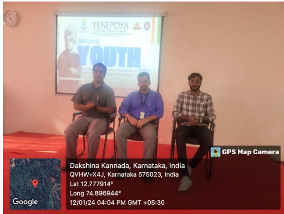
Inauguration of Youth day