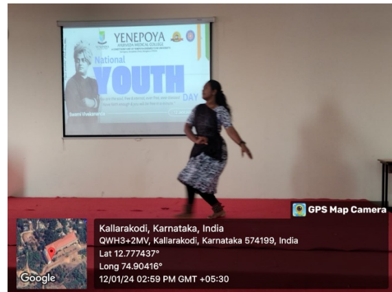
Talent hunt competitions